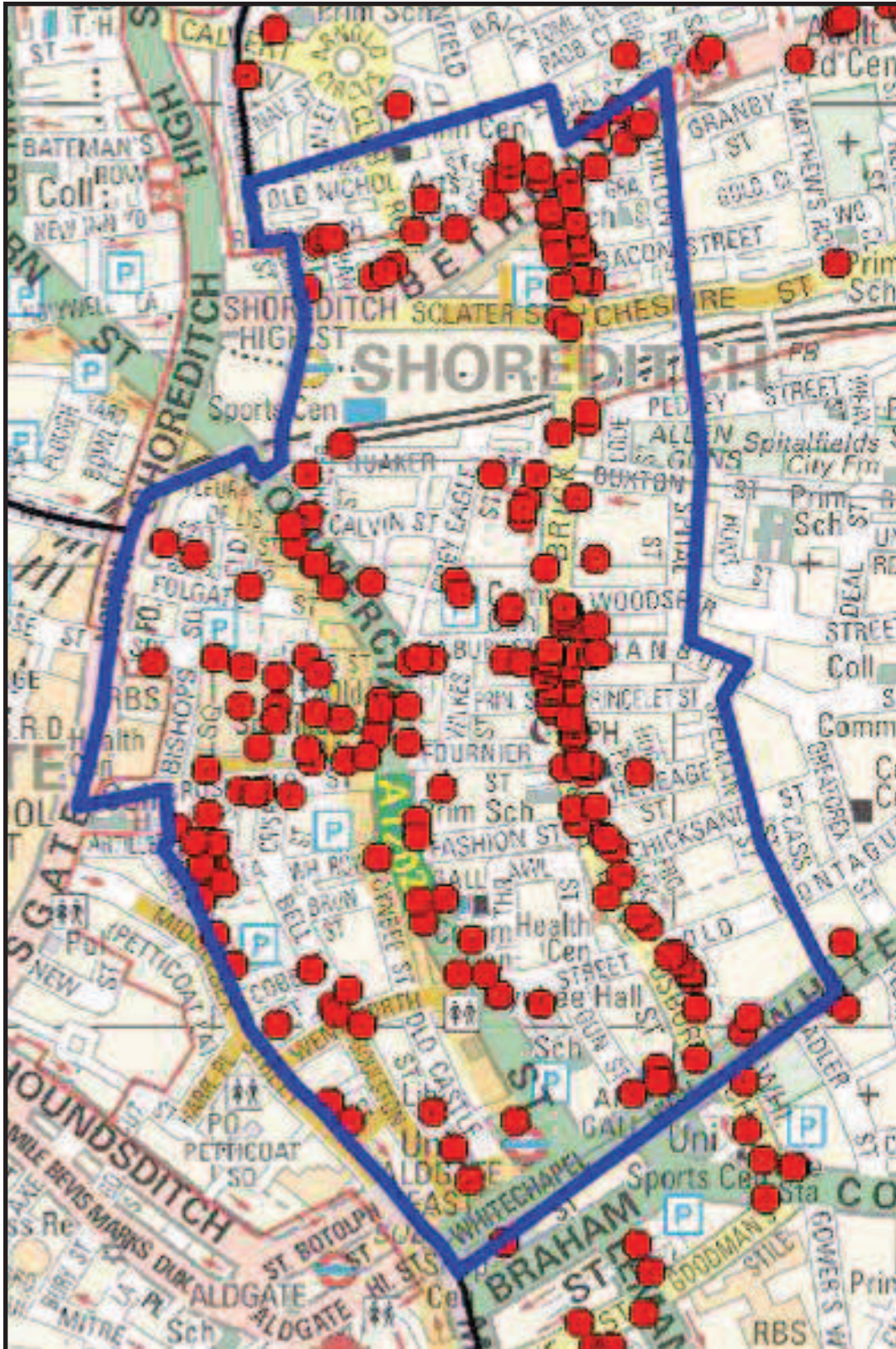
Map courtesy of Metropolitan Police

The proposed Saturation Zone area is detailed in the map below. The map shows all of the premises (red dots) currently licensed under the Licensing Act 2003 in the Brick Lane Area. The proposed area is defined by the blue line.